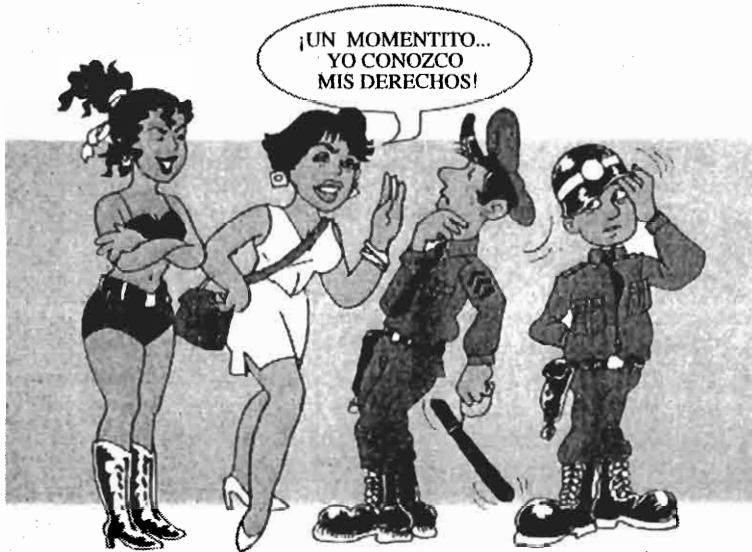
Figure 8.2 “Our Rights”

against sex workers, such as clients, brothel owners, police, and spouses. It also provides information as to the new laws that provide recourse for violence against women and the NGOs that can assist them. In essence, the materials serve as an intervention into the particular forms of violence against sex workers, starting with the experiences of sex workers themselves.