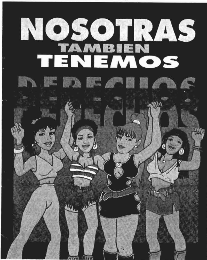
Figure 8.1 “We also have rights”

human rights—addresses the forms of violent exclusion, discrimination, and abuses that sex workers face. In using a rights-based discourse, sex workers claim their rights as women, as workers, and as citizens. Indeed, the sex workers' movement has reformulated the concept of prostitution as work and linked it to a human rights discourse for organizing and consciousness-raising. This position was articulated at MODEMU's first national conference (see figure 8.1):