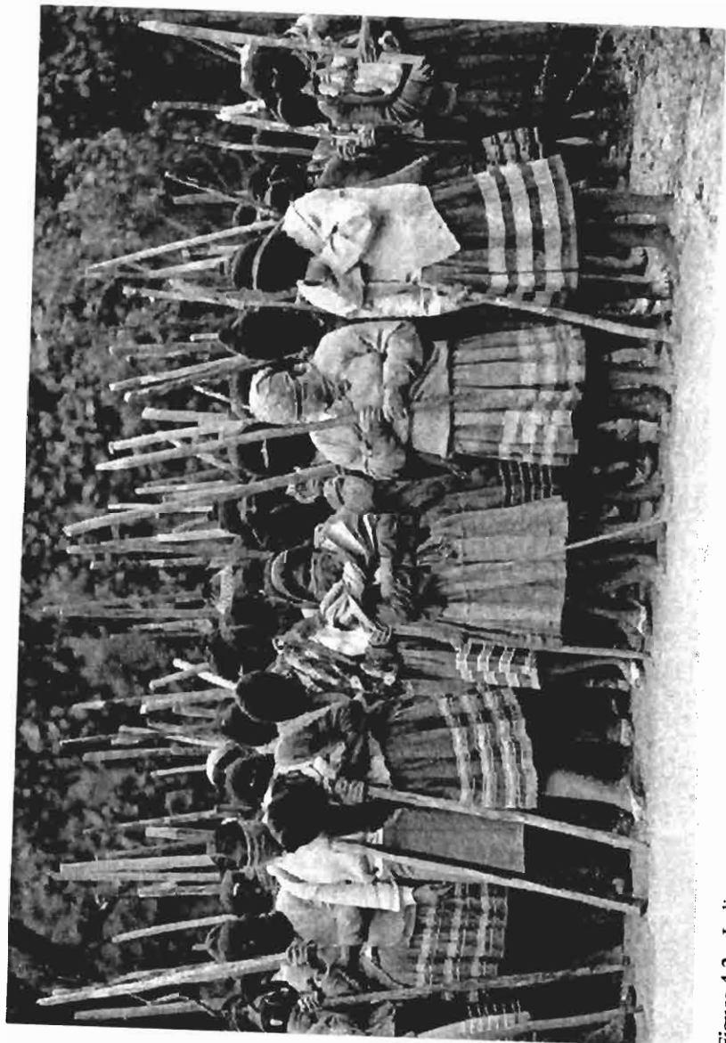
Figure 4.2 Indigenous Zapatista women

them! The indigenous ask to be recognized as equal and different within a nation reconstructed on a pluricultural basis” (Le Bot, La Jornada March 15, 2001, 19).