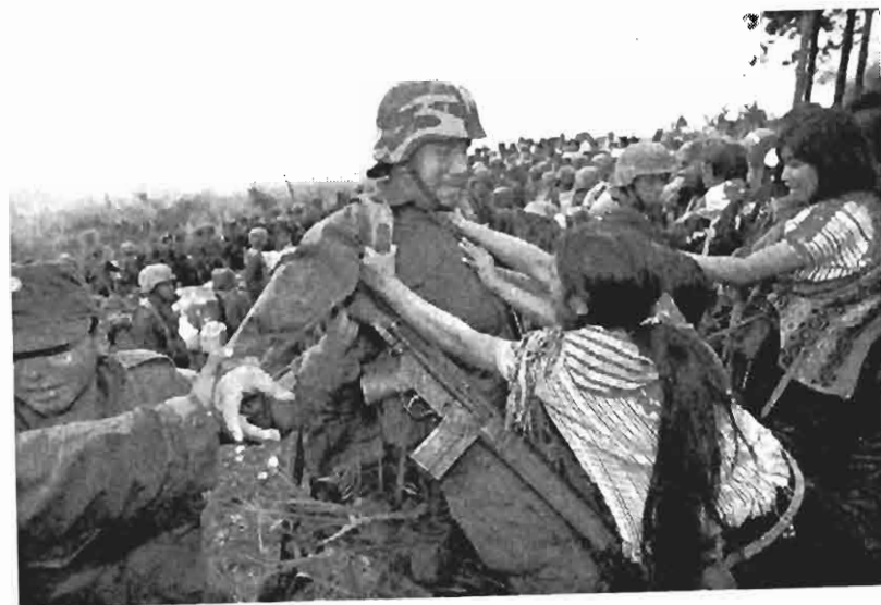
Figure 4.1 Zapatista women prevent the military from entering their community

movements in the Americas are “[. . .] the transformational force most visible on the continent” (Gil Olmos November 6, 2000, 7). According to Yvon Le Bot, the renowned French sociologist who specializes in the study of social movements in Latin America, “[. . .] they are claiming both respect for a cultural identity and democratic rights for all Mexicans” (Gil Olmos March 26, 2000, 3). They are the most relevant social actors of today. As Le Bot emphasizes, “what makes them extraordinarily ‘modern’ are the changes they claim to make in the hierarchical system of their communities and in the place of women against the exclusive masculine power” (Gil Olmos March 2000, 3). “The indigenous peoples,” he continues, “do not accept any more the image that was imposed on them from the exterior; they want to create their own identity, they do not want to be objects in the museums. It is not a question of reviving the past; it is a live culture. The only way to survive is to try to reinvent themselves, to recreate a new identity, while maintaining their difference” (Gil Olmos March 2000, 3; translation mine). Closely interlinked with the larger indigenous movement, the women’s movement started to create a presence of its own within the Zapatista uprising and later in the multiple indigenous organizations that have sprung up all around the country (see figure 4.1).